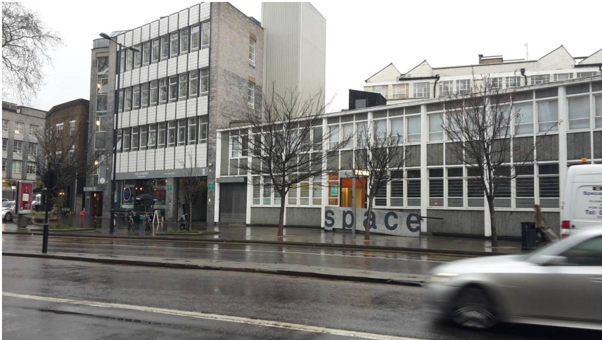
Figure 2: The Trampery London Fields (left) and SPACE Studios (right).